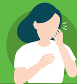
Covering coughs and sneezes